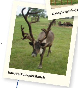
Hardy's Reindeer Ranch