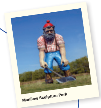
Manilow Sculpture Park